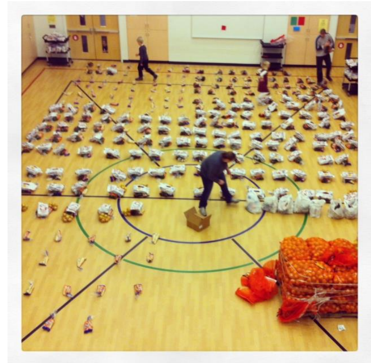
Francis H. Clergue PS Sault Ste. Marie